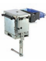
VARIABLE POSITION SPINDLE